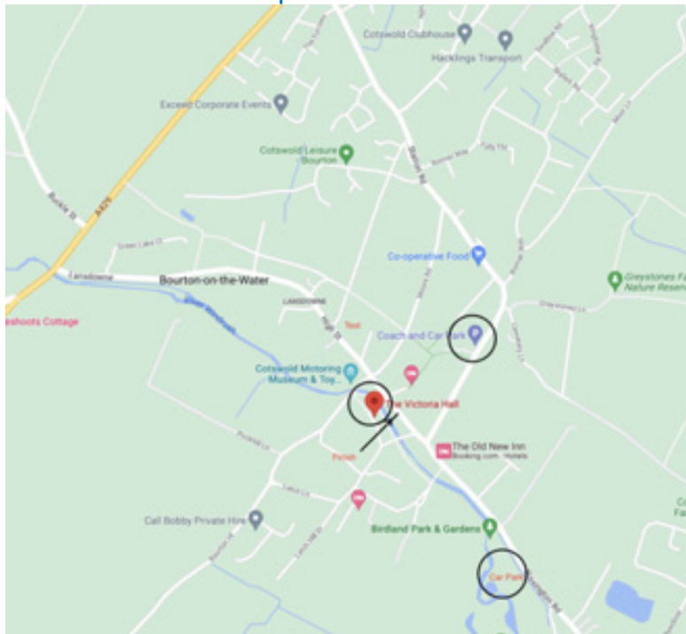
MAP 2 – showing Rissington Road and Station Road car parks and the Race HQ at Victoria Hall